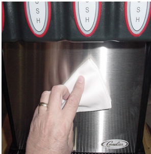
1. Wipe Splash Panel