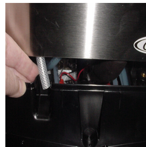
8. Reinstall Drip Tray.