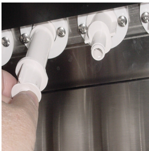
3. Pull Nozzle Down