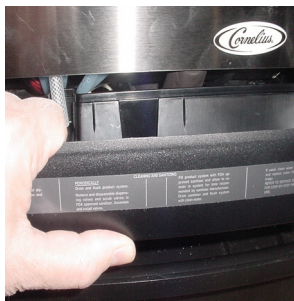
7. Lift Drip Tray and Wash