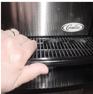
6. Lift Cup Rest and Wash