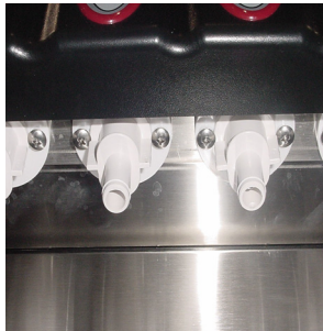
2. Remove Nozzles By Rotating Each 90 Degrees