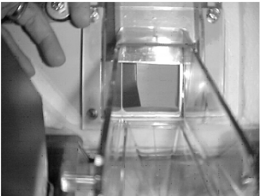
Figure 2. Gate Restrictor Full Opening