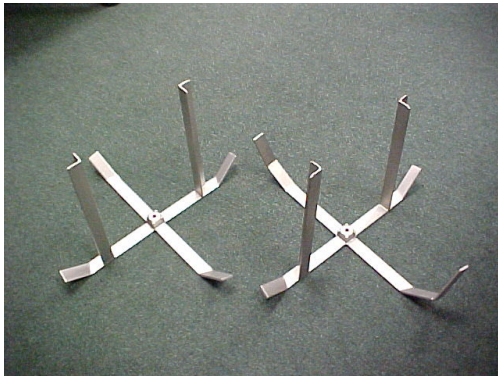
Figure 4. Standard Agitator (Left), New Agitator (Right)