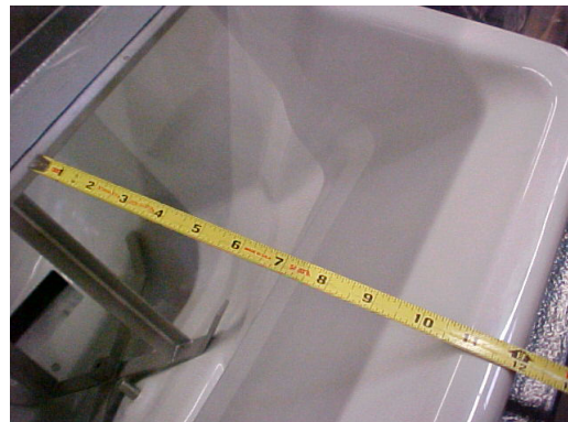
Figure 2. 11 1/2 Inch Opening

NOTE: It may be necessary to use a long screw driver or 2x4 board to pry up the adapter if it has been in place for a long period of time. This is due to the adapter gasket having a tendency to stick to the top of the hopper surface or silicon being added between the gasket and hopper surface at the time of install. Care should be taken to protect all surfaces to minimize damage during this step.