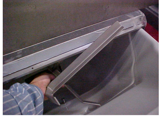
Figure 3. Remove Old Agitator

Note any possible mineral buildups and clean accordingly.