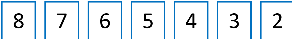
CB2323 Eight Line Coldplate with One Prism Valve (10 Brands - 8 Chilled & 2 Ambient)