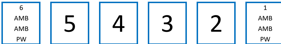
CB2323 Six Line Coldplate with Two Prism Valve (10 Brands - 6 Chilled & 4 Ambient)