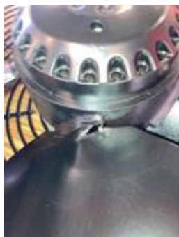
Damaged Fan Blade