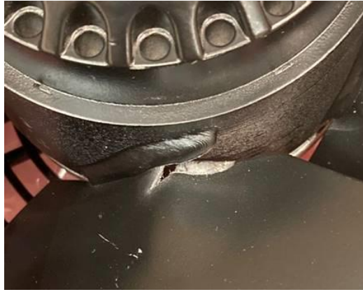
Damaged Fan Blade